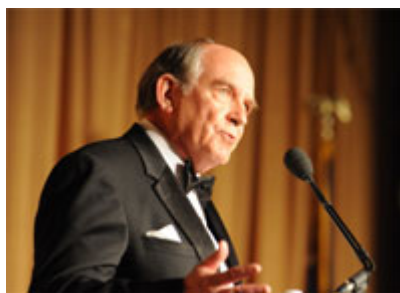
Charles Murray delivers the 2009 Irving Kristol Lecture.

America's current leaders seem to be leading us down the path to European-style social democracy. But although it makes for pleasant lives, the European model stifles human flourishing and erodes the civic and cultural institutions and habits that make for a vibrant, sustainable, and satisfying way of life. Moreover, critics of the European model are about to get a boost from scientific discoveries in neuroscience and genetics that human nature is malleable, which will undercut the foundations of social democracy. The answer: American exceptionalism, in which individuals freely unite to construct a civic culture. What follows is the text of Charles Murray's Irving Kristol Lecture, delivered at AEI's Annual Dinner at the Washington Hilton on March 11, 2009.