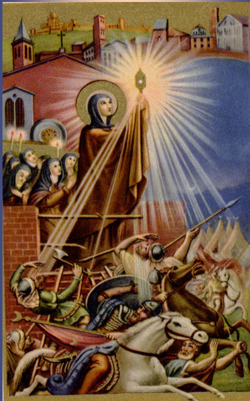
Saint Clare of Assisi Pray for us!

+++ Show us, O Lord, your kindness, and grant us your salvation. I will hear what God proclaims; the Lord - for he proclaims peace. To his people, and to his faithful ones, and to those who put in him their hope. Near indeed is his salvation to those who fear him, glory dwelling in our land. Kindness and truth shall meet; justice and peace shall kiss. Truth shall spring out of the earth, and justice shall look down from heaven. The Lord himself will give his benefits; our land shall yield its increase. Justice shall walk before him, and salvation, along the way of his steps. Psalm 85