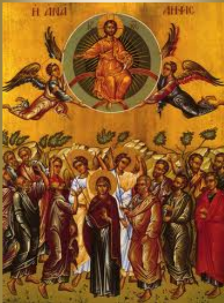
The Ascension of the Lord