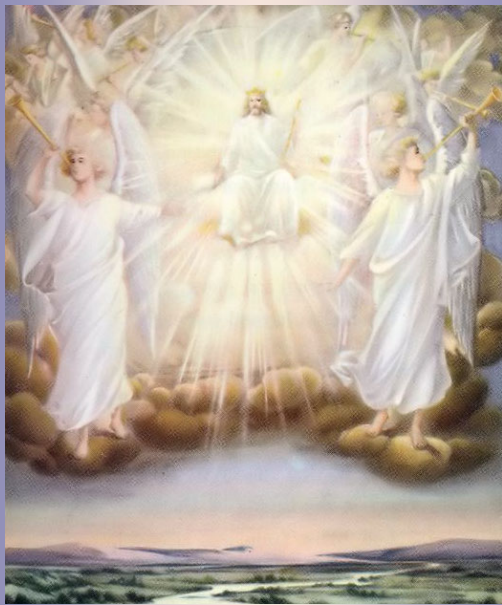
The Ascension of the Lord