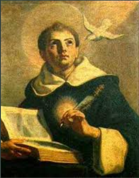
Saint Thomas Aquinas Pray for us!

To you I lift up my soul, O Lord, my God, In You I trust; let me not be put to shame, let not my enemies exult over me. No one who waits for You shall be put to shame; those shall be put to shame who heedlessly break faith. Your ways, O Lord, make known to me; teach me Your paths. Guide me in truth and teach me, for You are God my savior, and for You I wait all the day. Remember that Your compassion, O Lord, and your kindness are from of old. The sins of my youth and my frailties remember not; in Your kindness remember me, because of Your goodness, O Lord. Psalm 25