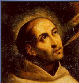
Saint John of the Cross Pray for us! Feast day - December 14

Friday, December 31 5:00 pm Saturday, January 1, 2011 9:00 am 11:00 am